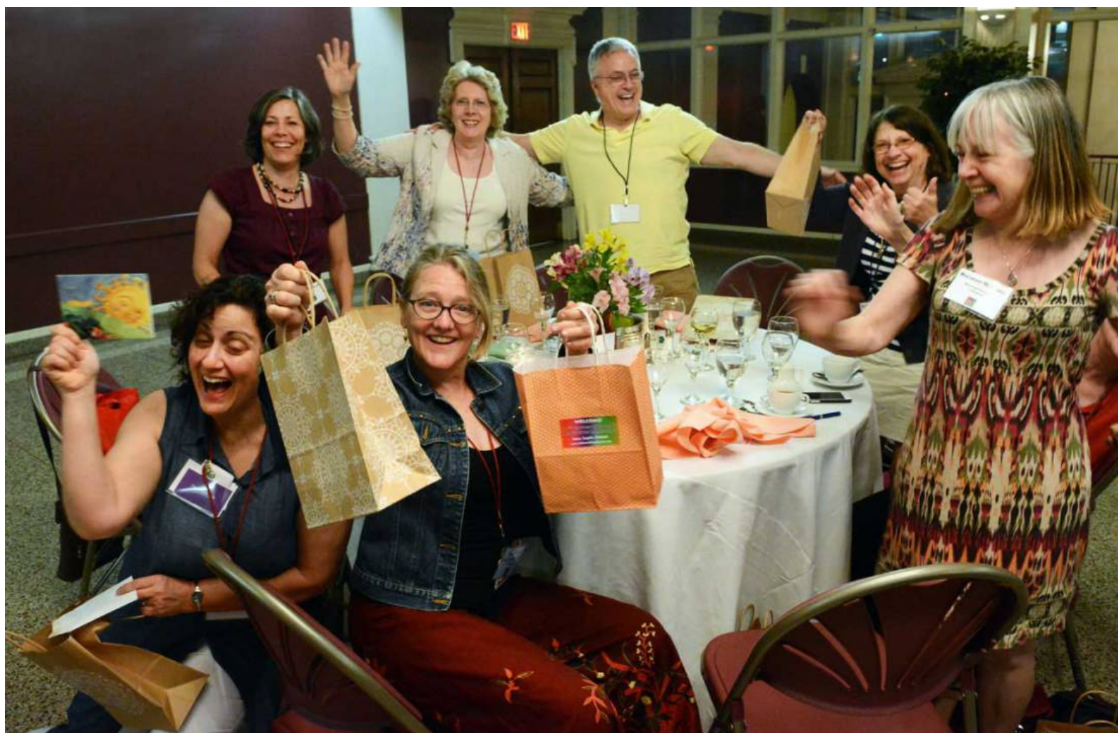
Prizes for the Trivia winners at Saturday's dinner!

Overall, it was a great experience, hoping to make it back again next year. If you have any questions, please feel free to post below in the comments!