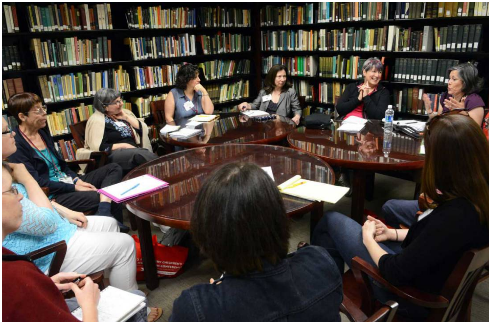
Open table discussion in the library.

I studied field biology in college, so I wanted to learn more about how I could better integrate my nonfiction interests into my illustration work and picture book writing. There were tons of networking opportunities – I really loved nerding out and hearing about all of the wonderful projects the other attendees were working on. I learned about black holes, Biosphere 2, biographies of incredible historical figures and the life histories of unusual creatures, including horseshoe crabs and giant squid.